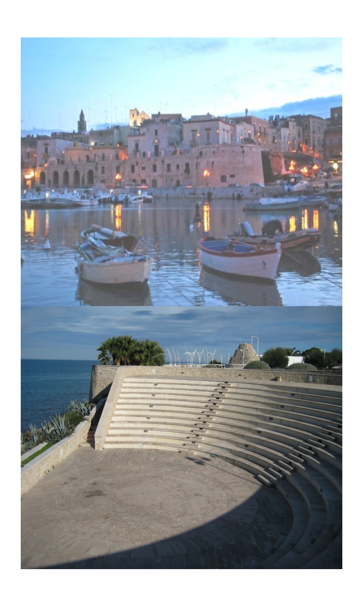
"The world is a book and those who don't travel read only a page of it"