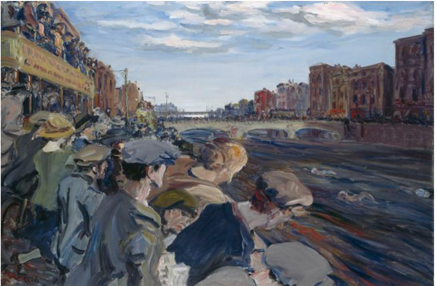
Jack B. Yeats (1871- 1957), The Liffey Swim (1923), oil on canvas, 61x91.5cm, National Gallery of Ireland.